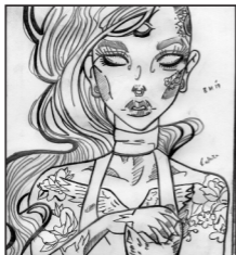
RADHIKA NAIR TYBMM (B)