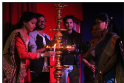
The BMM faculty lighting the lamp