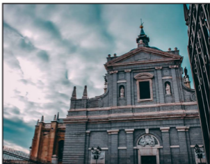
DEESHAK PATRA TYBMM (A)