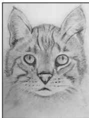
NAMITA NAIR TYBMM (A)