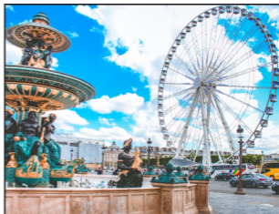
SHRUTIKA SARASWAT TYBMM (B)