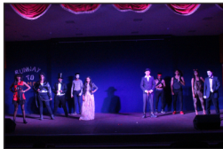
Fashion show 'Runway to Glamour'