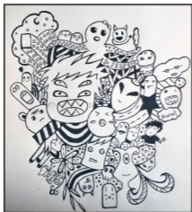
NISHEETH TYBMM (A)