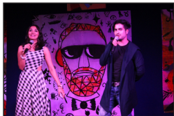
The movie promotion team of Bhangover